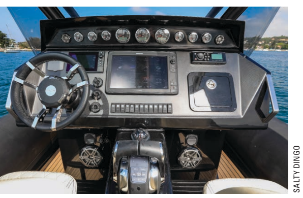
Inside the cockpit of the Venom 44.

Following a trend towards larger, more versatile rigid hull inflatable vessels, Ribco Australia is offering vessels in the Maxi RIB category including the 28 ST (two-step hull), the Seafarer 36 and the flagship Venom 44 model. All vessels are Category B CE Certified, rated to 200 nautical miles offshore and wave heights to 4 metres. Ribco is also planning to introduce new models later this year, including a new Venom 39 and a 32 variant of the Seafarer.